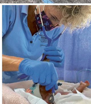
Stabilization of a near term infant (IV access, blow-by oxygen) shortly after arriving in the Prem Unit at Rundu State Hospital (Sabine Berger).