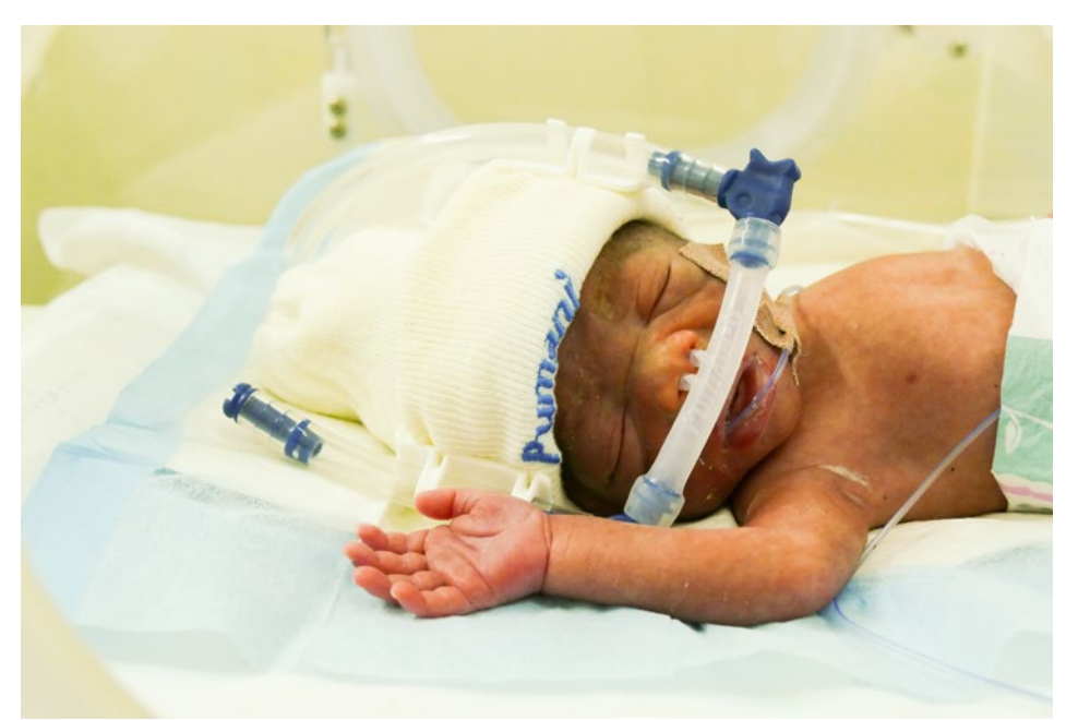
Fig. 6. Twin B (gestational age estimated at 30 weeks, birth weight 1150 g) initially responded well to nasal continuous airway pressure (nCPAP).