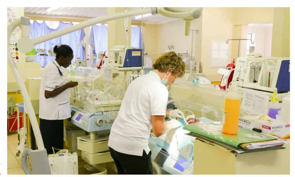
Fig. 13. Working together with the local staff at the bedside to provide 1:1 teaching on everyday aspects of neonatal care.