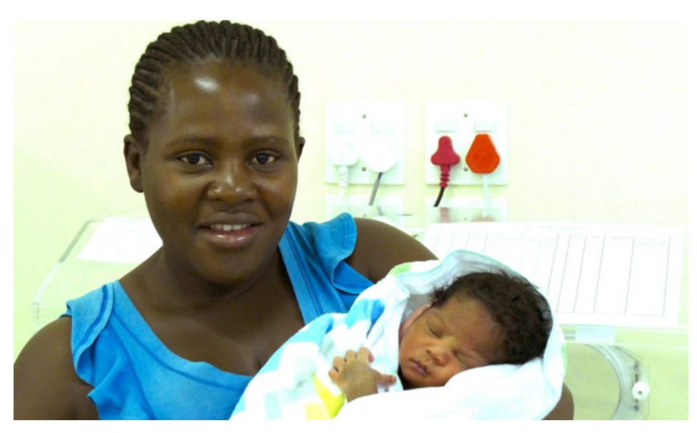
Fig. 4. Finally, the day of discharge from hospital has arrived: the baby had suffered from hyaline membrane disease and had been supported with bCPAP for 5 days.