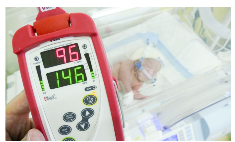
Fig. 2. Preterm infant on bCPAP monitored with a battery-operated Massimo® Radical-5 pulse oximeter.