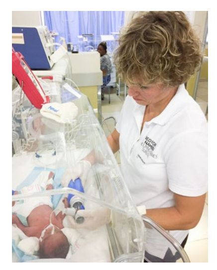
Fig. 11. Preterm infant (estimated gestational age 32 weeks, birth weight 1440 g) with severe hyaline membrane disease: treatment was restricted to supplemental oxygen with resulting oxygen saturations between 44 – 88%; when cardiac arrest occurred after several hours, resuscitation restored spontaneous circulation, but the infant failed to start breathing again and died.

The remaining two infants were twins (birth weight 1280 g and 1150 g, respectively) born at a gestational age of approximately 30 weeks on the way to the hospital, where they arrived in critical condition with severe hypothermia (33.2°C and 33.3°C, respectively) and hypoxemia (SpO2 of 45% and 48%, respectively). They both had surfactant deficiency and initially could be stabilized on bCPAP (Fig. 5, 6). Unfortunately, they died within 72 hours from air leak complications (Fig. 7–10). Since there was no continuous suction system available, manual aspiration following the insertion of drainage catheters was attempted but ultimately failed (4).