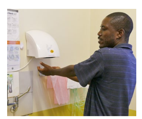
Fig. 19. Two hand blower dryers are installed to improve hand hygiene.

In July 2017, we had bought some reclining folding chairs to facilitate Kangaroo Mother Care (6). To further encourage this method, we bought some cloth at a local Chinese store and asked tailors at the local marked to sow Kangaroo skin to skin tubes (Fig. 14–16).