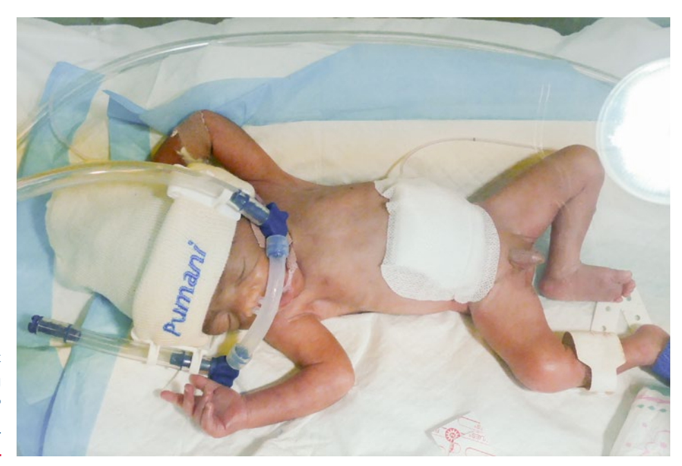
Fig. 5. Twin A (gestational age estimated at 30 weeks, birth weight 1280 g): rewarming after initial stabilization on the Pumani<sup>©</sup> bCPAP device.