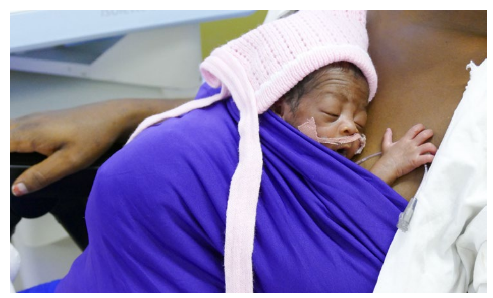
Fig. 15. Kangaroo Mother Care: the tube cloth sowed at the local marked holds the baby firmly in place.