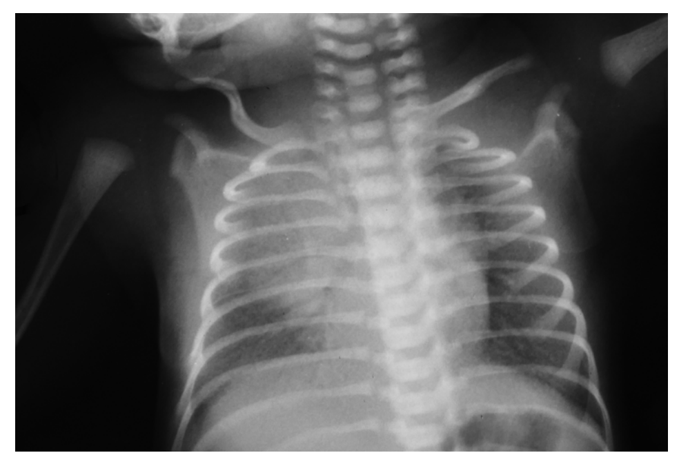
Fig. 1. Chest X-ray of a preterm baby showing signs of hyaline membrane disease (reticulogranular pattern, air bronchogram).

During our stay in Rundu, five patients were put on bCPAP because of severe respiratory distress due to hyaline membrane disease (surfactant deficiency) (Fig. 1–3). Three of them recovered over a period of several days and eventually were discharged home (Fig. 4).