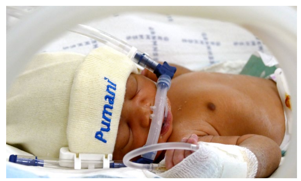
Fig. 3. Preterm infant supported with a Pumani<sup>©</sup> bCPAP device.