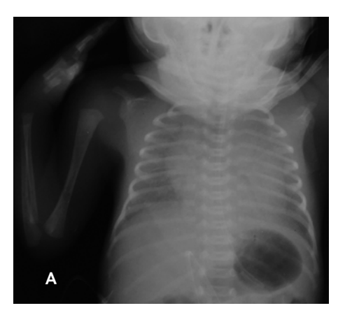
Fig. 9. Twin B: A) Chest X-ray following stabilization with bubble CPAP on DOL 1: low lung volumes, reticulogranular pattern and air bronchograms, consistent with hyaline membrane disease (note malposition of the UVC in the portal vein); B) Chest of X-ray following gradual deterioration on DOL 3: right-sided pneumothorax with mediastinal shift to the left (note malpositioned UVC).